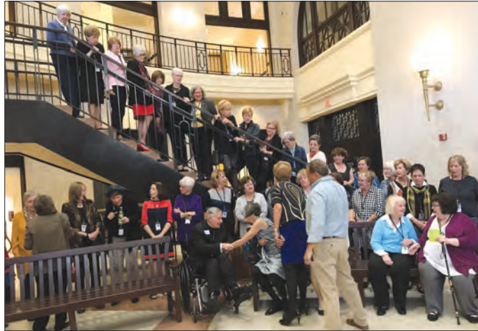
Marian High School's class of 1967 celebrates their 50th reunion in October.