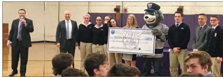
Ceremony celebrating the Worcester Railers $5,000 donation for new Girls' Hockey program.