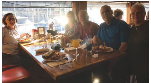
The classes of 1966 and 1967 celebrated their reunion in October.