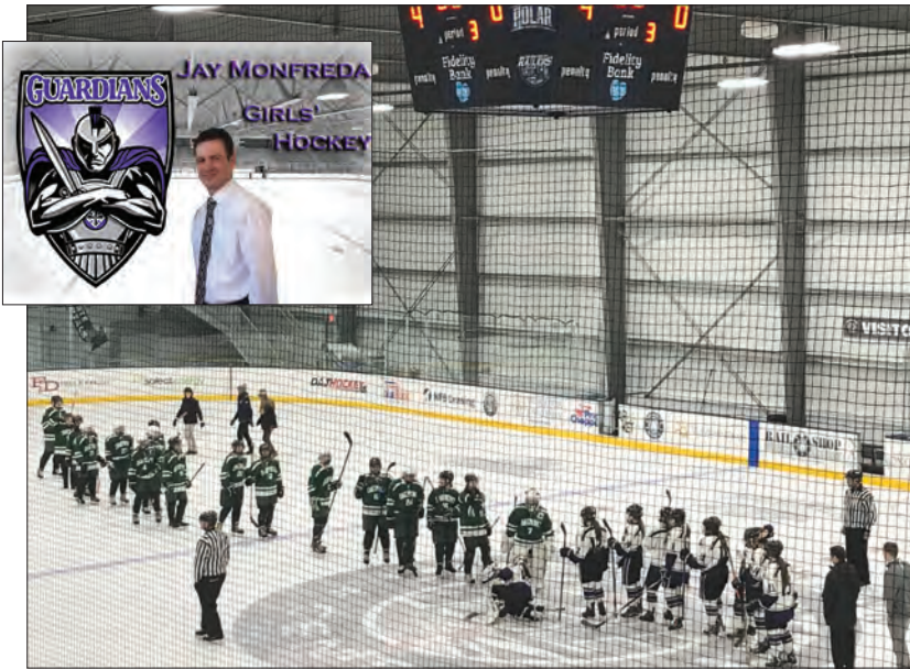
Victory for SPM Girls' Hockey!