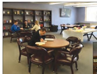
Renovations to our library and lobby made possible by fundraising and grant awards.