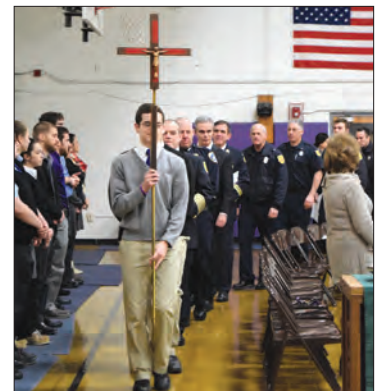
Processional at Police/Fire mass.