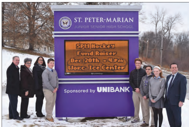
Officials from Unibank and SPM students join President Cummings to celebrate new installation of electronic messaging center; made possible by Unibank's $30,000 donation and fundraising yielded from Gala.